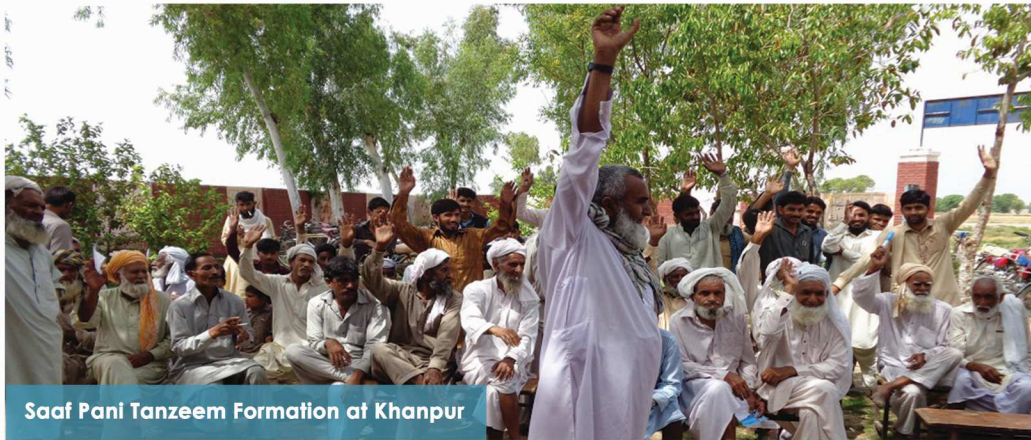
Saaf Pani Tanzeem Formation at Khanpur

The selection criteria and initial assessment by Engineering Management Consultants (EMCs), PSPC shared the list of 73 villages in the specified 4 tehsils for the provision of drinking water facility. The MDF & Awaz CDS carried out the rigorous social mobilization process specially designed for the PSPS project and the 4 key steps were being followed for the formation of Saaf Paani Committees in the 73 villages of 4 Tehsils. Mentation plan and strategies were discussed. Deputy COP ensured the cooperation in the project implementation.