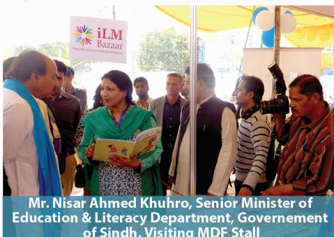
Mr. Nisar Ahmed Khuhro, Senior Minister of Education & Literacy Department, Government of Sindh, Visiting MDF Stall

ILM Bazaar was an initiative of DAI where they can show case solution of partners. ILM Bazaar was organized